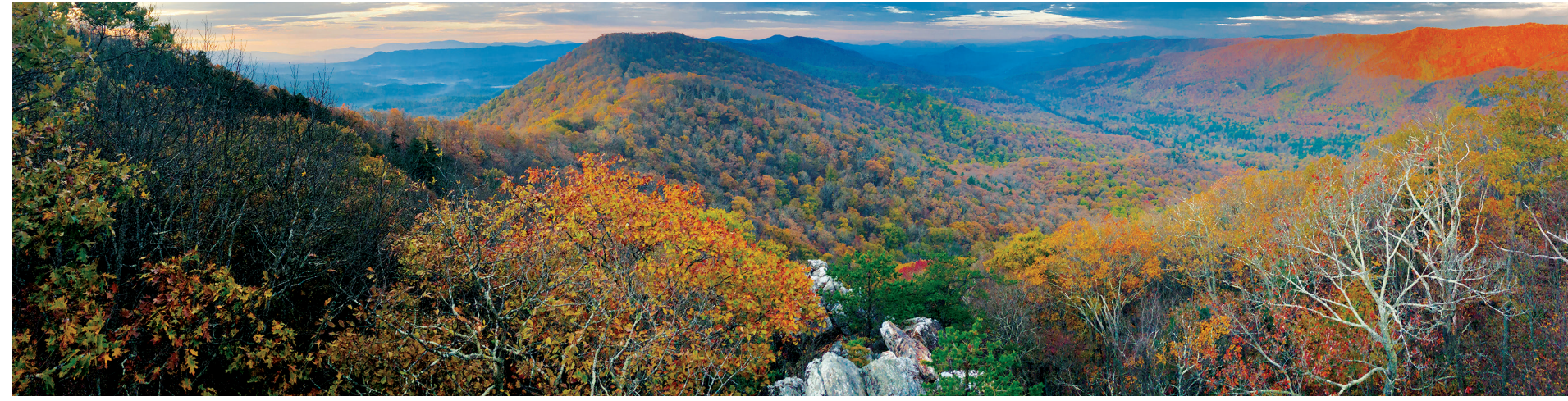
Rich Hole and Rough Mountain