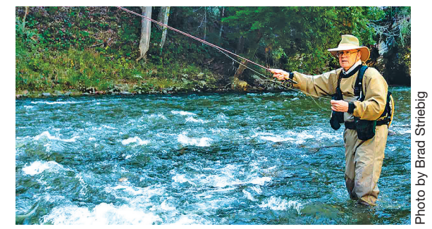
Flyfishing in Cowpasture River