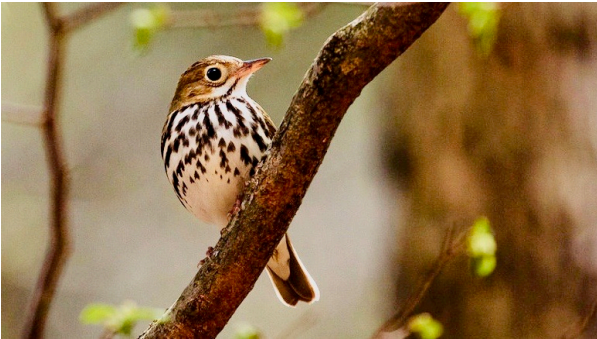
Ovenbird