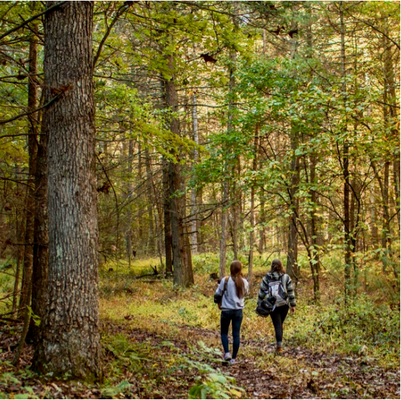
Hikers exploring Beech Lick Knob.