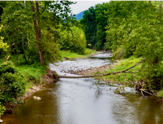
North Fork of the Shenandoah River

"Designating the Beech Lick Knob Wilderness will protect important headwaters of the North Fork of the Shenandoah. Cleaner waters will support healthier fish and safer swimming."