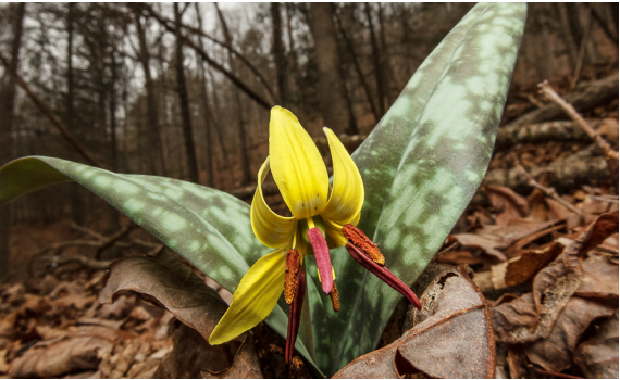
Trout lily