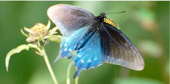
Pipevine swallowtail.

Wilderness designation offers these benefits at no cost to taxpayers.