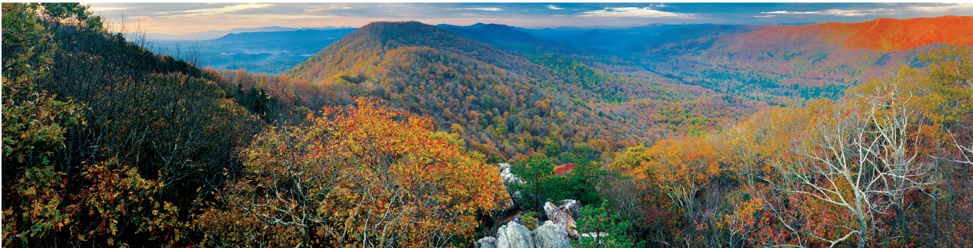
Rich Hole and Rough Mountain